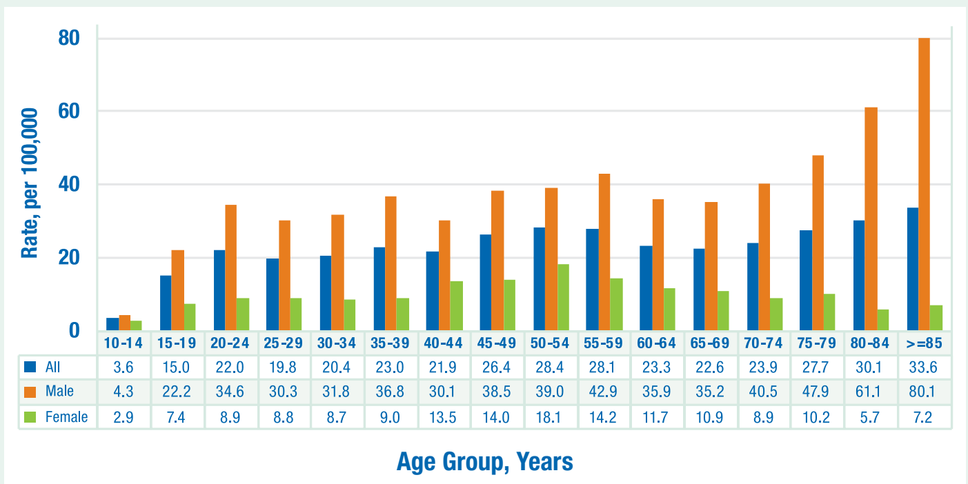
Figure 2. Suicide death rate by age group, Oregon, 2003-2018